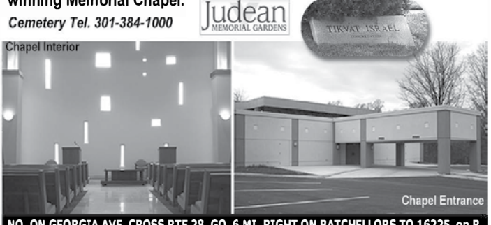
NO. ON GEORGIA AVE, CROSS RTE 28, GO .6 MI, RIGHT ON BATCHELLORS TO 16225 ON R TIKVAT ISRAEL JULY-AUGUST 2024

To reserve your sites please call Aaron Chusid at Tikvat Israel: 301-762-7338.