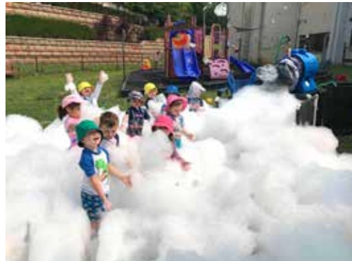
Youngsters in the ECC enjoyed getting lost in the foam clouds generated by a machine in the outdoors play area.

The ECC still has a few spaces available for the school year. Please feel free to refer family and friends. We are always happy to give tours or answer questions about the school.