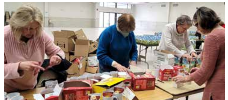
Members of the Women's Network pitched in to put together mishloach manot for congregants at Purim.