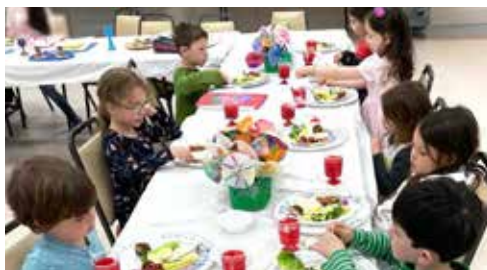
Youngsters learned Passover rituals at the ECC's model seder.