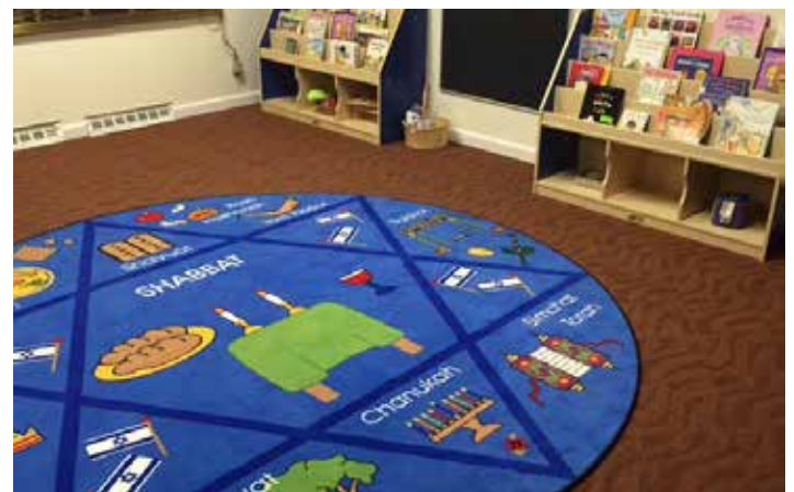
A $5,000 gift to the synagogue has funded a newly furnished play area for pre-schoolers in the rear of the sanctuary.

Submissions for the next issue of the bimonthly publication should be sent to her at andrea.kronzek@gmail.com by Feb. 1.