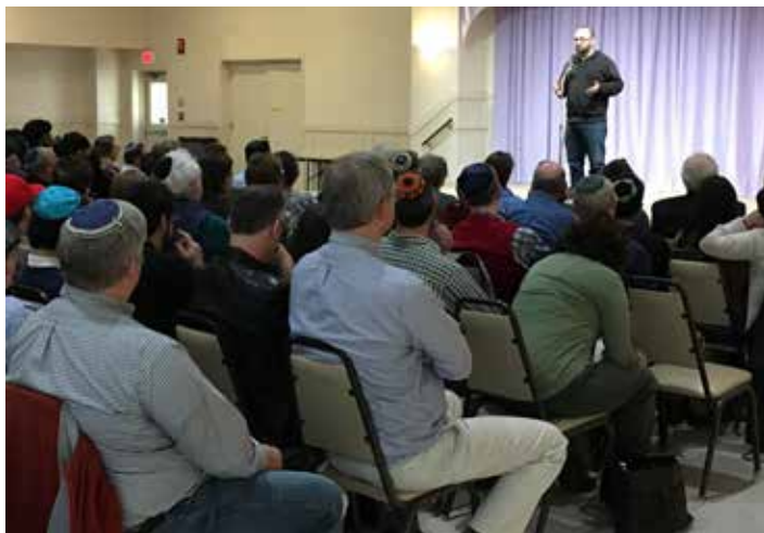
The sizable crowd attending the True Stories event in the synagogue's social hall tuned in to 10 story tellers.