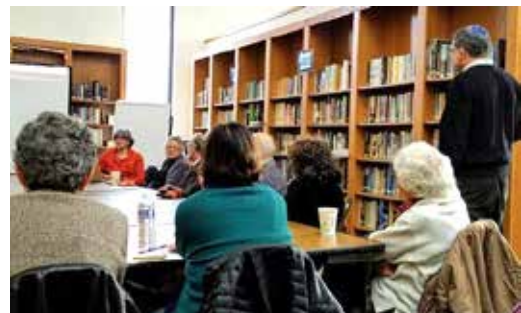
An archivist from the Holocaust Museum donated a book during an event in the Flax Library.

The donated first edition of A Vanished World will be on display in the glass-enclosed case in the lobby outside the Flax Library.